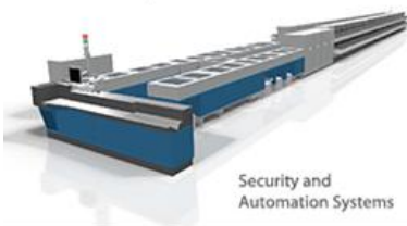
Security and Automation Systems