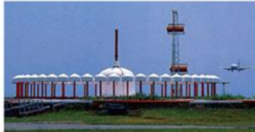
Air Traffic Control Systems