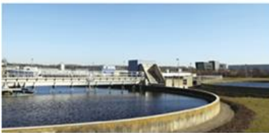
Water Treatment Systems