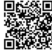
Toshiba Online Application System

Application deadline: 20 August, 2019 at 7am (JST)