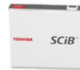
Lithium-ion Rechargeable Battery